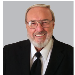
Yisrayl Hawkins THE HOUSE OF YAHWEH

8 He who practices sin is of the devil , for