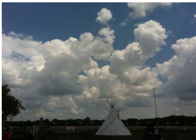
Sky over the Lakota Ranch in Greenville, Texas