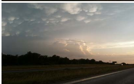
The sky on our way to Abilene.