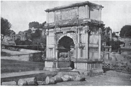
Titus Gate in Rome, Commemorating the Sack of Jerusalem in 72 CE. Photograph circa 1943