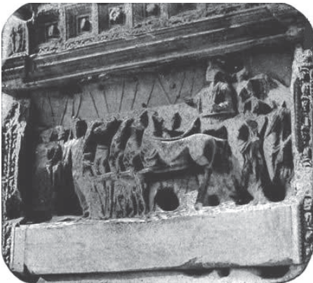
Arch of Titus Detail: Triumph of Titus

The Romans were not generous or forgiving with those who challenged or fought