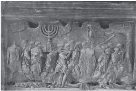
Arch of Titus Detail: Spoils of Jerusalem

The Arch of Titus is located on the highest point of the Via Sacra, a road leading to the Roman Forum. This is a single arch, 15.4m high, 13.5m wide, and 4.75m deep. The marble reliefs stand nearly 2.5m in height. On the Arch of Titus is a relief depicting the Romans' triumphal procession, returning with spoils from the Jewish Temple in Jerusalem . Especially prominent is the sacred Menorah , but we can also see the Table of the Shewbread , and the silver trumpets which called Jews to Rosh Hashanah.