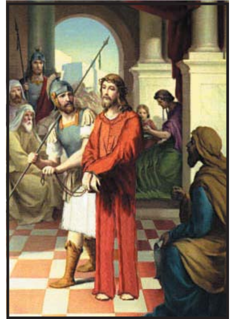
Depiction of the Savior being brought to court.

You have clothed the Only Prophesied Savior in orange.