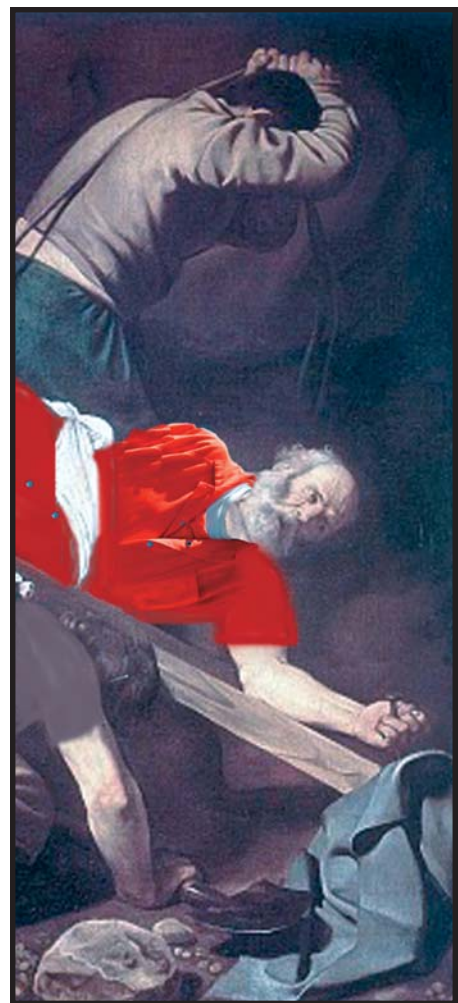
Depiction of the Apostle Kepha being hung on the stake.

The twelve Disciples having been taught by the Savior wrote the same Message, that only those who call with the Name Yahweh would have Salvation. The Apostle Kepha, like the other Apostles, was killed for preaching this Message. This is the same Message that the Prophesied Two Witnesses are assigned to bring.