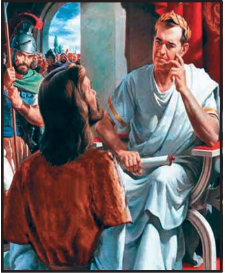
Depiction of the Savior's judgment before Pilate.

T he prophesied job of the Two Witnesses is to bring forth Salvation which means that the Name Yahweh must be brought forth because there is no Salvation in any other name, as the Savior also declared over and over in His Work before being falsely accused, sold through betrayal, arrested, and murdered.