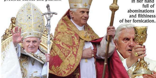
...having a golden cup in her hand full of abominations and filthiness of her fornication.