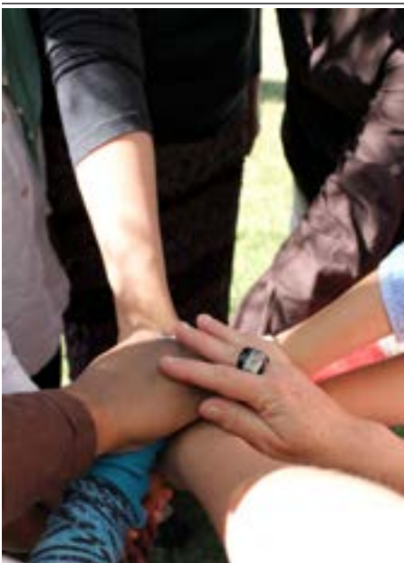
Yahweh's Righteousness teaches unity.

Did you catch that? Notice verse 7 , there in front of Yahweh.